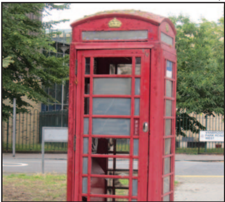
Pic 2: Kiosk today

Some kiosks have been sold very cheaply for a variety of purposes. We are looking for innovative ideas from residents which might improve the appearance and use of this historic property.