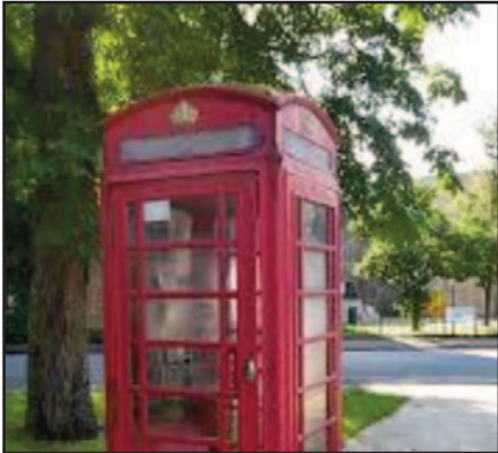
Pic 1: Telephone kiosk in 2002 (reproduction permission sought from Historic England)

In 2002 Historic England ran a project called Images of England which was intended as a photographic record of all the listed buildings in England. One of the local entries in that project was the K6 telephone kiosk at the corner of Westcombe Park Road and Vanbrugh Park Road West. Since 2002 it has sadly deteriorated, largely through lack of use.