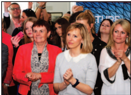
The ambassador with Danish fans