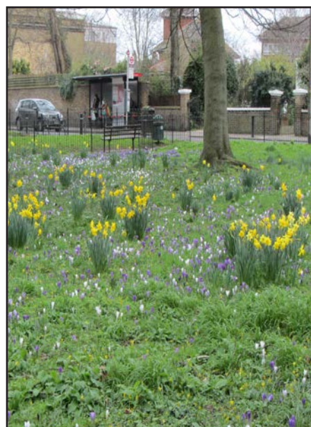
Spring is in the Air – Flowers Blooming at Batley Green

six weeks either to object or to agree to the proposal.