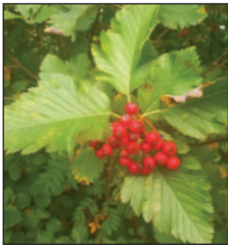
Whitebeam berries

to take the place of one of the rowans that suffered so badly in last year's drought, as well as a big bag of spring bulbs. Whitebeams – Sorbus aria – are beautiful trees, with pale grey undersides to the