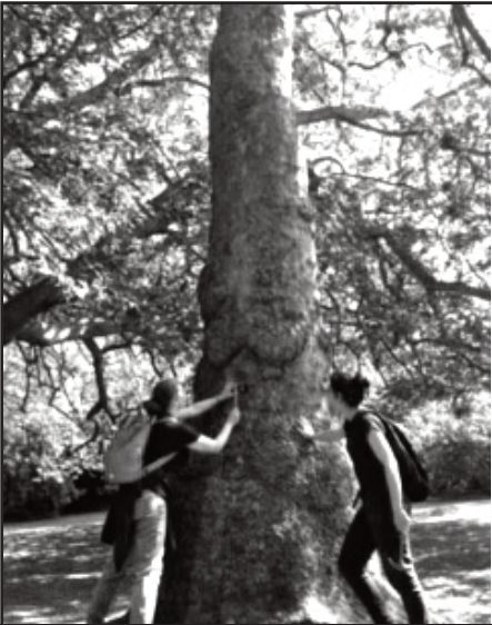
Fiona Machen (FoMG) with an RBG Tree Officer labelling one of the famous London Planes

Mycenae Gardens is a local treasure, but few realise how rich it is in the variety of trees. There are at least 36 different varieties in the main gardens alone. The Friends of Mycenae Gardens enlisted the expertise of Greenwich Tree Officers to identify the trees, and held a labelling day on Friday 6th May, with a 'tree party' afterwards to celebrate. Rich Sylvester (@richstories) was there to lead the festivities, and soon had a tribe of small children following him around some of the newly-labelled trees as he told his stories.