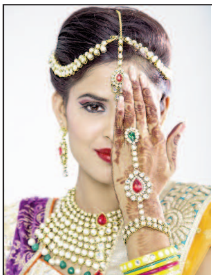
Beautiful Indian Bride adorned with jewellery and henna

Eight colourful stands depict the ceremonial and religious roles of jewellery in ancient cultures in China and India's Mughal Empire, and paintings carrying jewellery worn by the modern celebrities who flaunt it. The ninth stand features jewellery designed by year 4 pupils at Brindishe Manor.