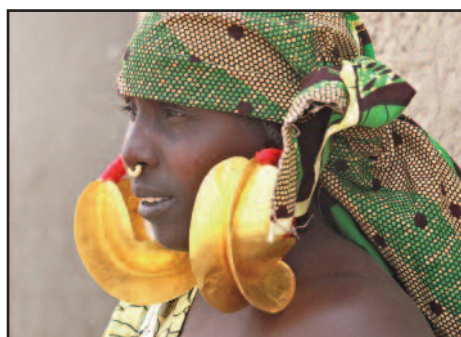
The Fulani nomadic herders in West Africa wore their wealth in the form of gold jewellery that they could carry with them at all times

Garden and Bond Street, the centres of London's jewellery trade, are included as well as the Victoria and Albert Museum, which houses one of the finest jewellery collections in the world.