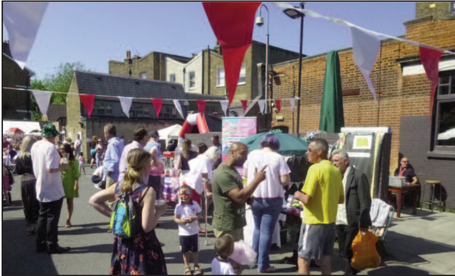
Many local residents were invited to view the Royal Wedding of the Duke and Duchess of Sussex aka Prince Harry and Meghan Markle. On TV! But many then abandoned their sofas to attend wedding parties – at the Pleasaunce, in Siebert Road and at the Royal Standard (above).

Planning applications can be viewed in the library, or at the Woolwich Library on the lower ground floor of the Woolwich Centre, 35 Wellington St. They may also be viewed on www.greenwich.gov.uk/planning