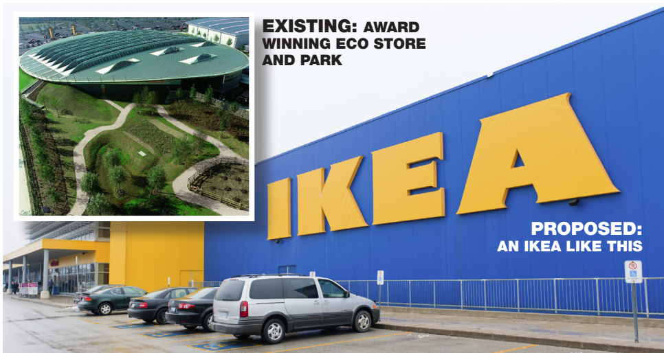
EXISTING: AWARD WINNING ECO STORE AND PARK