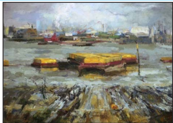
ABOVE: The Waste Barges at Greenwich by Basia (Karnika) Burroughs

The work produced is of very high quality, and features a range of styles and media, including pastels, oils, water